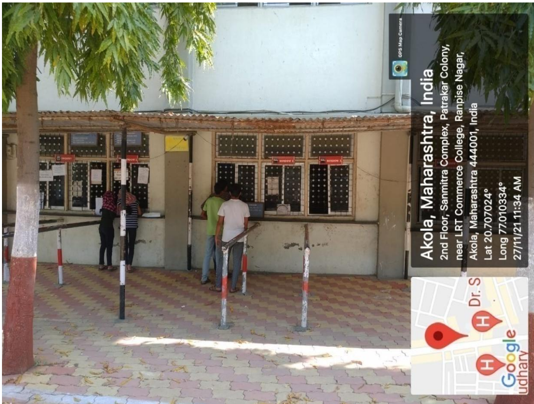
Ramps for support for Physically Disabled Students